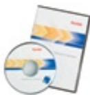
Image Quality—the Kodak advantage for SharePoint